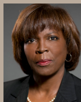
Ertharin Cousin Distinguished Lecturer and Distinguished Fellow Stanford University